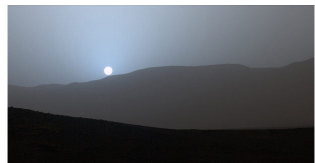
Blue Sunset on Mars

NASA's Perseverance Rover imaged a typical clear sky on Mars with characteristic red (or pink or salmon) colour.