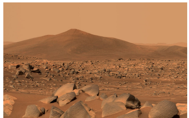
Pink Sky on Mars

(By the way, all that red soil on Mars is largely iron ore, the same thing that makes large parts of the Western Australian outback look red.)