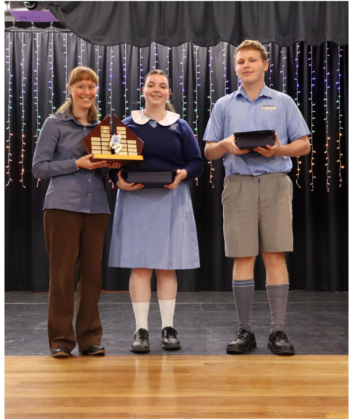
THE TARA GLIBERT MEMORIAL AWARD