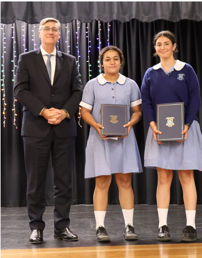
PARKES RSL SUB BRANCH AWARD