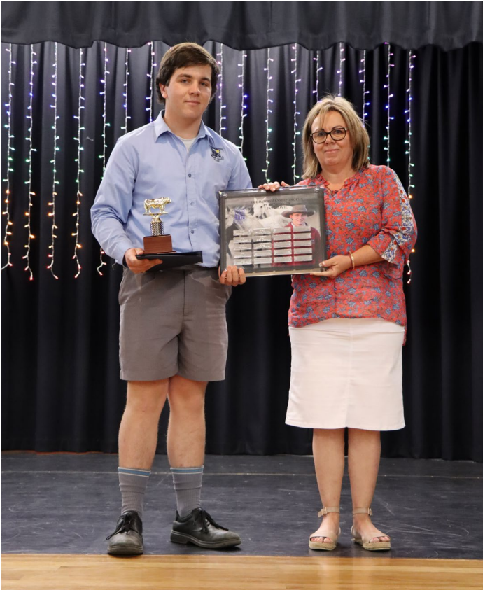
JAYE DAVIE MEMORIAL AWARD