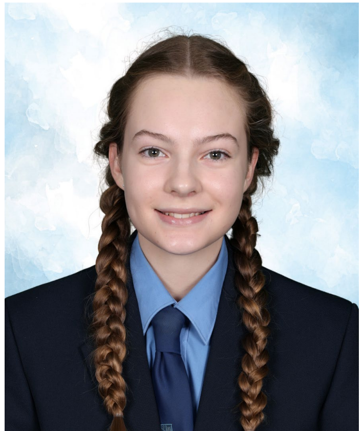
ADF LONG TAN AWARD